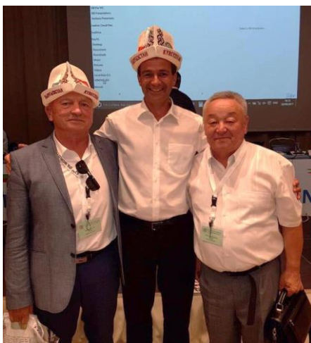
with the representatives from Kyrgyzstan

These are the lyrics of the Bulgarian national anthem, and they deserve to be quoted in such circumstances, as I am convinced that there are significant parallels between what the national anthem of Bulgaria states and the true meaning of our presence at the IPA World Congress 2017.