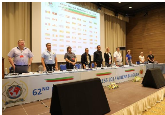
the International Executive Board of the IPA and IAC staff during the IPA anthem

Alongside a rich agenda centred on administrative subjects giving an insight into the activities of the past year, we also managed to open a window into the IPA's future by sharing experiences and best practice through various themes and presentations from the sections and board members. This enabled everyone to get involved in thinking together about realistic as well as feasible projects and goals with the potential of increasing the IPA's scope for development.