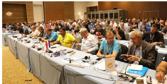
the participants of the 62 nd IPA World Congress

These are the lyrics of the Bulgarian national anthem, and they deserve to be quoted in such circumstances, as I am convinced that there are significant parallels between what the national anthem of Bulgaria states and the true meaning of our presence at the IPA World Congress 2017.