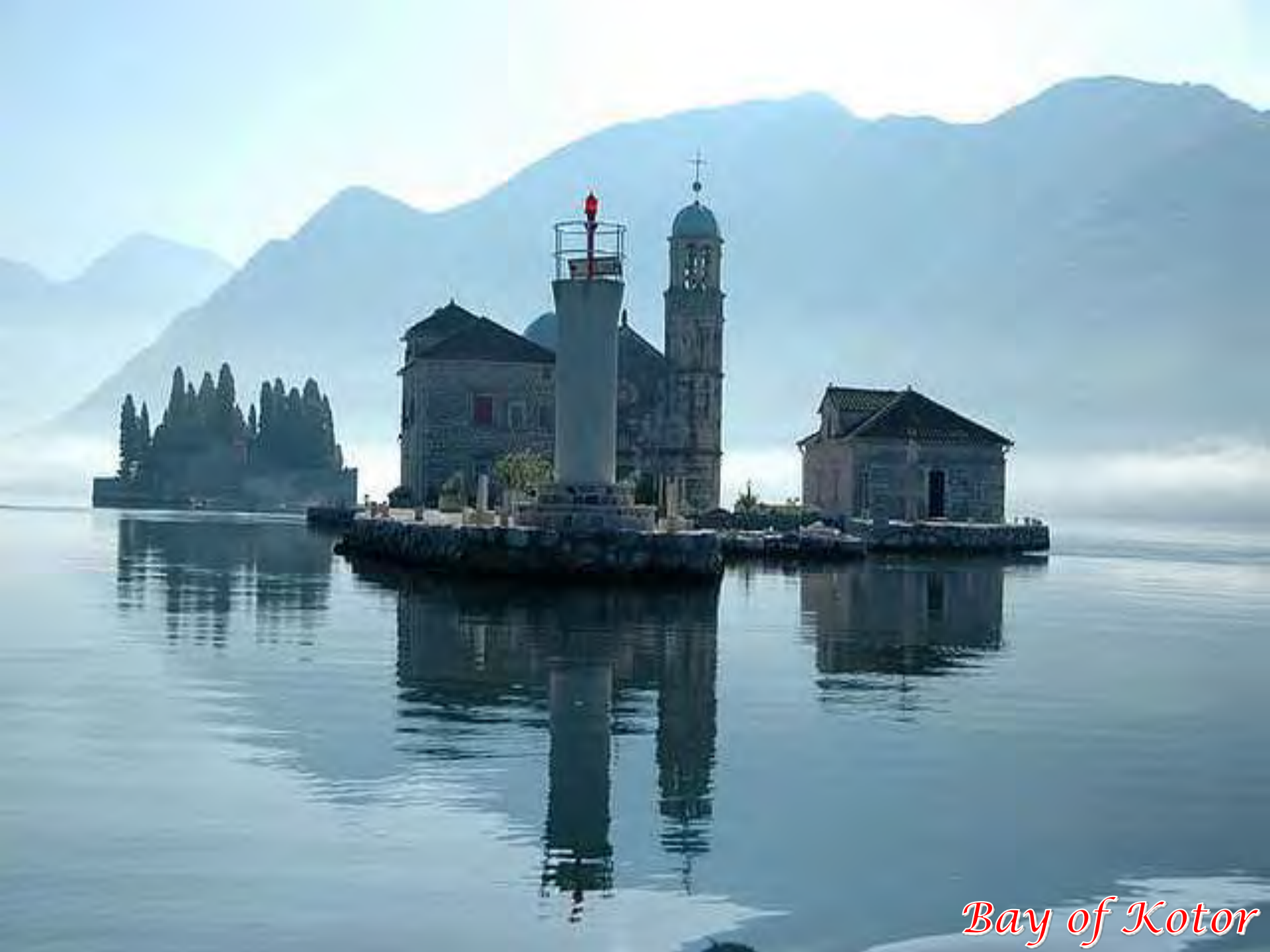
Bay of Kotor