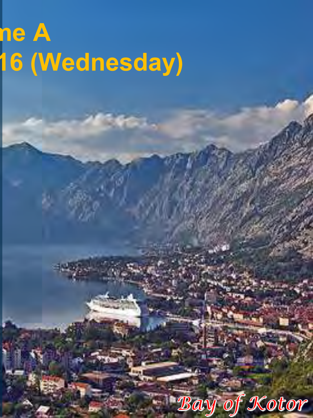
Bay of Kotor